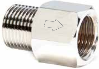
Threaded valve M/F